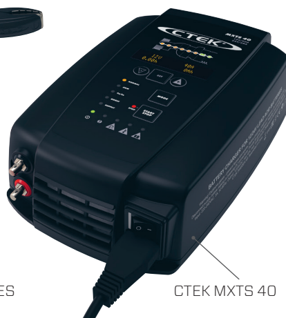
CTEK MXTS 40