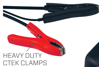
HEAVY DUTY CTEK CLAMPS